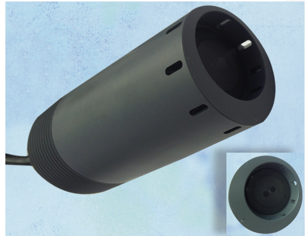
Submersible Turbidity Sensor

The Q-Blast Auto-Clean assembly is housed in a NEMA 4X enclosure suitable for indoor or outdoor use. The system includes an integral compressor and air-pulse control components, with a power supply for the entire air supply system incorporated into the design. A simple connection to the Q46/76 monitor provides the sequencing for the system and allows the operator to select cleaning frequencies as often as once every hour to as little as once every 999 hours. To insure performance in extreme cold conditions, a thermostatically controlled heater is included in the assembly, allowing operation down to -40^{\circ}\text{C} .